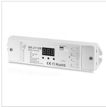
178973 RGBW DMX enabler/decoder 4 channel (0.35A each CH)