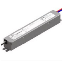
17433 Kit driver 48V