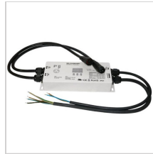
1789730 RGBW DMX enabler/decoder WP 4 channel (0.35A each CH)