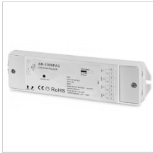
3104173 RGBW RF controller 4 channel (0.35A each CH)